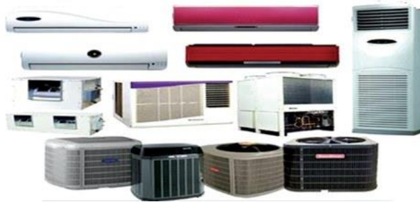
2 - Works with most types of AC's