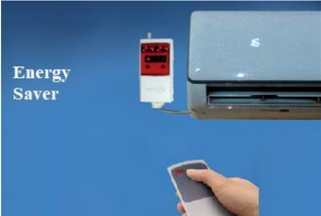
1 - AC Energy Savers

the overcooling period which is required only for few hours in a day in peak summer but it is over-utilized because of the balance of time. This is the area where closed-loop algorithm-based technology comes in to picture, where the compressor run cycle is optimized as per the geographical climatic conditions with the help of dual sensors.